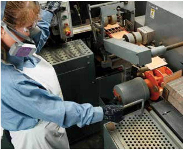
AGM PLATE WRAPPING & STACKING – Advanced AGM plate wrapper automatically delivers the highest levels of repeatable quality – ensuring product integrity and performance.