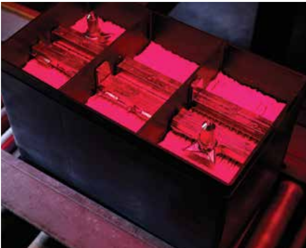
AGM VISION SYSTEM – This advanced process capability safeguards product integrity by verifying key battery components are correctly oriented and inserted into the container.