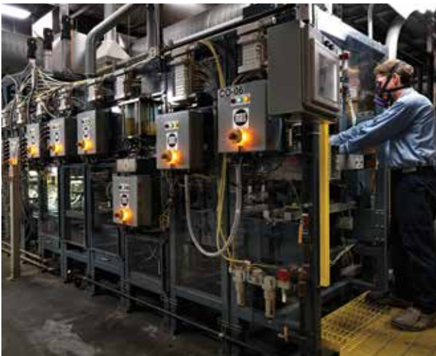
AGM INLINE CELL ASSEMBLY – Cells are loaded and move through a completely automated C.O.S. assembly process. The Inline C.O.S. Assembly process is a “Best-in-Class” manufacturing feature that delivers finished product integrity benefits that are unmatched in competitive terms.